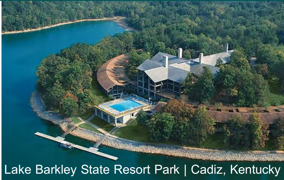
Lake Barkley State Resort Park | Cadiz, Kentucky