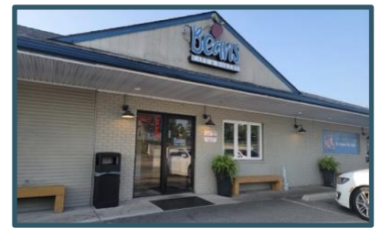
Bean's Café & Bakery